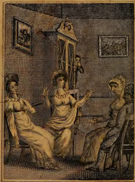
THE AUTHOR BEHIND THE BOOK-CASE.